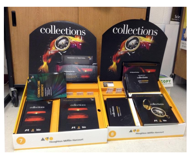
Extensive free sample packages from commercial publishers, like these provided to a small rural school with only 100 students, have become the norm.

Committees typically review the materials according to various district criteria (including IMET, MC<sup>2</sup>, various state tools, etc. – see <a href="http://cdaschools.org/page/5951">http://cdaschools.org/page/5951</a> for one district's tools and process), discuss their evaluation with each other, and then narrow the list to a smaller number of programs to look at in more depth, which often involves piloting the programs in actual classrooms.